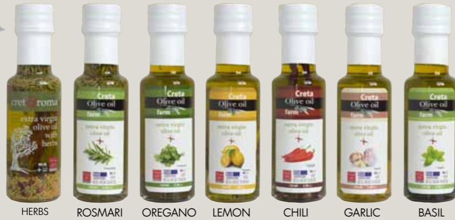
HERBS ROSMARI OREGANO LEMON CHILI GARLIC BASIL

The flavored oils are made using a special recipe mixing extra virgin olive oil with herbs or citrus. They are an excellent prodorpisma served in pastries or can be perfect flavoring salads, steamed vegetables, meat or fish as well can be the key ingredient of a delicious special sauce.