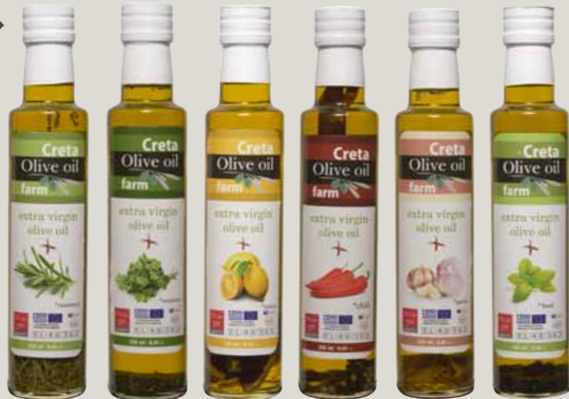
ROSMARI OREGANO LEMON CHILI GARLIC BASIL